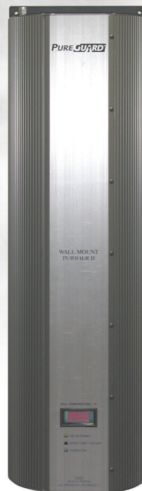
Wall Mount II

PureGuard wall mount heated getter gas purifiers provide total removal of all impurities and parts-per-trillion (ppt) purity for nitrogen, argon, helium and other rare gases. The compact packaging provides continuous purification and comes in sizes for most flow rates.